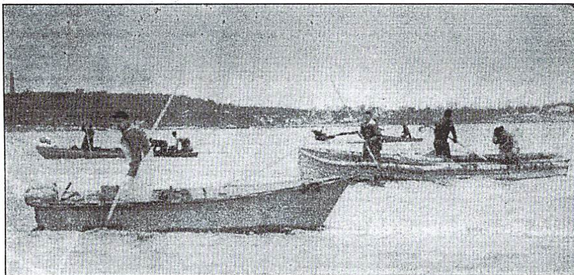
Scallop fisherman patrol Duxbury Bay.

The town landing at Mattakeesett Court dates to 1900 and its road to 1902. During this time, this landing was not as active as it is now and various improvements were made to it by the town, such as in 1916 when the town acquired 100 feet more frontage and